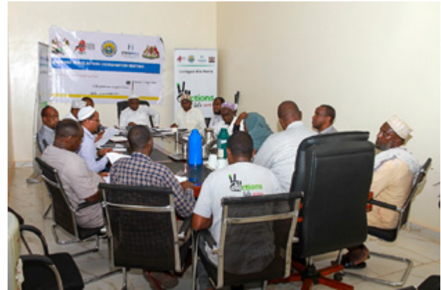
The Mandera Peace Actors Forum gathers to discuss strategies for joint resource mobilization in response to the Banisa conflict.

Beyond these more explicit political interests, climate shifts and cycles of drought, as well as local skirmishes over scarce resources such as water and grazing land, have also fed into broader inter-group tensions. These have been exacerbated further by the influx of small arms and light weapons (SALW), which have increasingly been used for criminal acts and for self-defence.