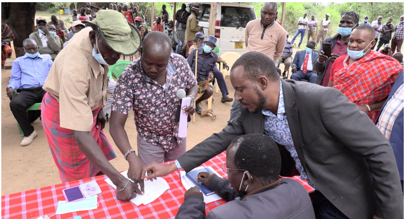
Lokwasol, Suguta CMC member signing the Orwa peace accord.