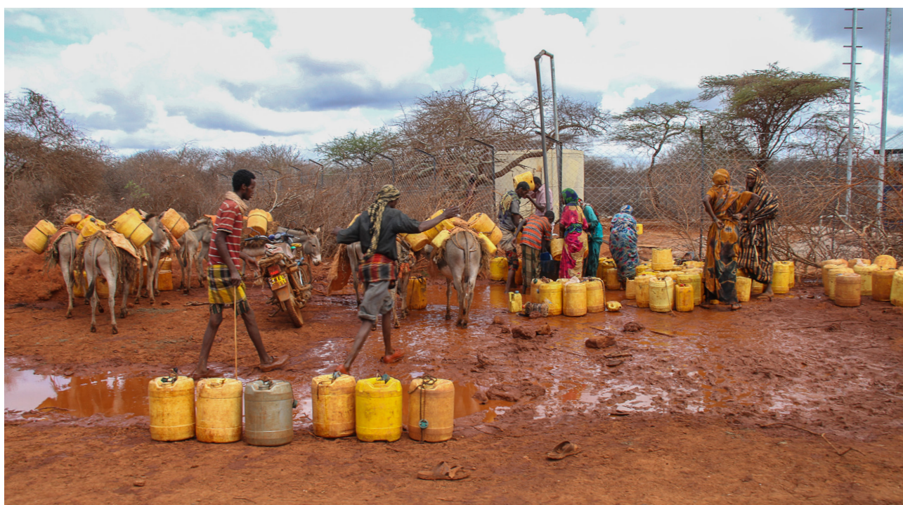
Degodia and Garre community members come together to share the Doomal water point, demonstrating the power of collaboration between villages in the face of scarce resources