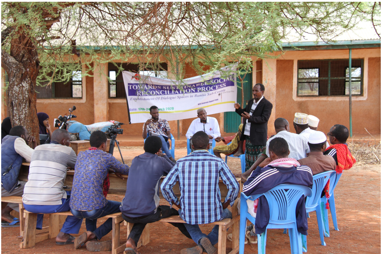
CMC member addressing Eymole-Malkamari structure at Eymole

The fourth story (Part 4) identifies what we have learned. It lists several take-aways based on initial analytical outputs. These show how the two case studies described in the report can inform ongoing team efforts, as well as broader peace support efforts, and be valuable for both practitioners and policy makers. Although it is not exhaustive, Part 4 addresses key themes that emerged from the learning process, including the author's and team members' reflections on how these experiences can enrich a ' Track 6 ' approach and give practical content to principles such as inclusivity and meaningful participation.