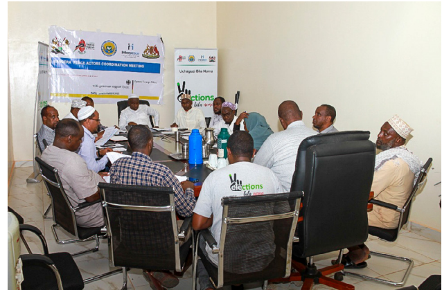
The Mandera Peace Actors Forum gathers to discuss strategies for joint resource mobilization in response to the Banisa conflict.

Beyond these more explicit political interests, climate shifts and cycles of drought, as well as local skirmishes over scarce resources such as water and grazing land, have also fed into broader inter-group tensions. These have been exacerbated further by the influx of small arms and light weapons (SALW), which have increasingly been used for criminal acts and for self-defence.