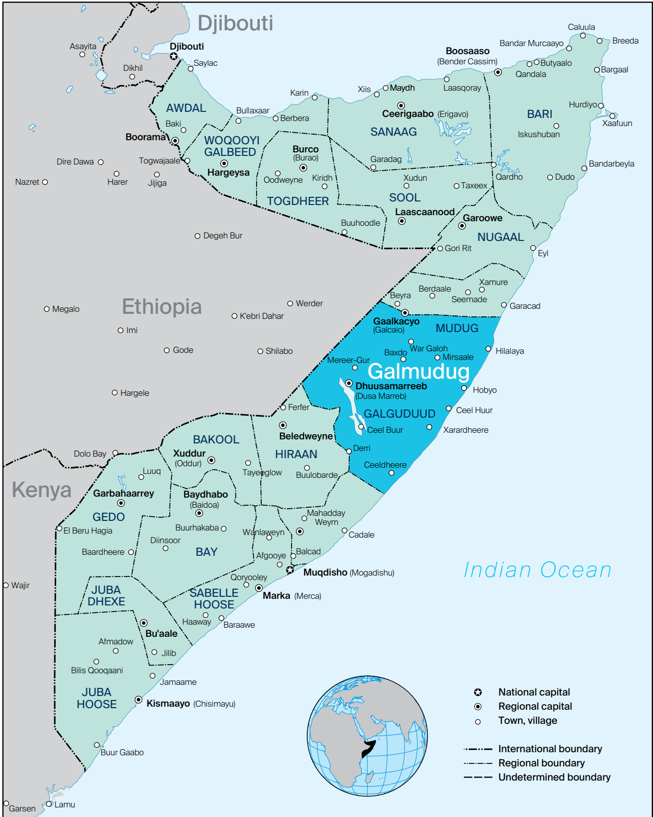
Modified Map by Interpeace • Original map by United Nations, Department of Field Support, Cartographic Section.