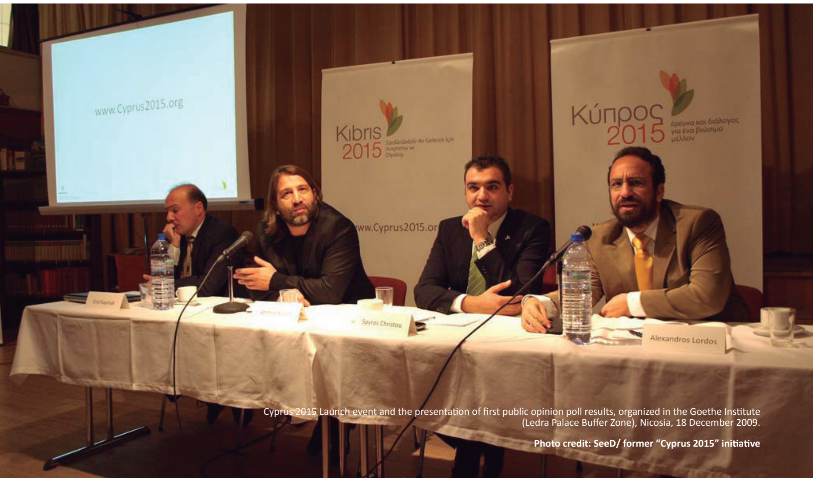
Cyprus 2015 Launch event and the presentation of first public opinion poll results, organized in the Goethe Institute (Ledra Palace Buffer Zone), Nicosia, 18 December 2009.