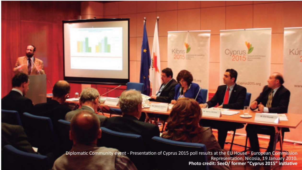
Diplomatic Community event - Presentation of Cyprus 2015 poll results at the EU House - European Commission Representation, Nicosia, 19 January 2010.