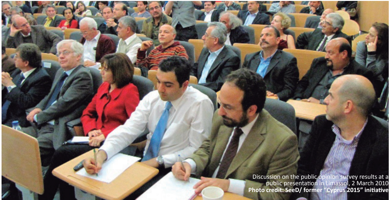
Discussion on the public opinion survey results at a public presentation in Limassol, 2 March 2010